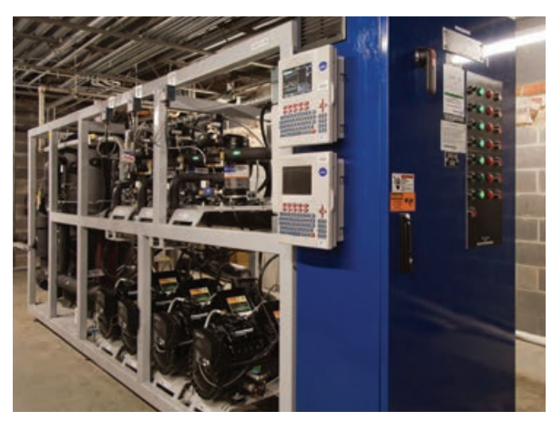
Hillphoenix warm climate CO<sub>2</sub>-based transcritical booster system installation utilizing Emerson Climate Technologies components

CO<sub>2</sub>'s low critical point temperature and high operating pressure (around 1,500 psig) are characteristically not found in traditional HFC-based refrigeration. These are the primary reasons for the reluctance to move toward CO<sub>2</sub>. But, with advances in system technology