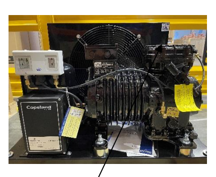
On packaging nameplate