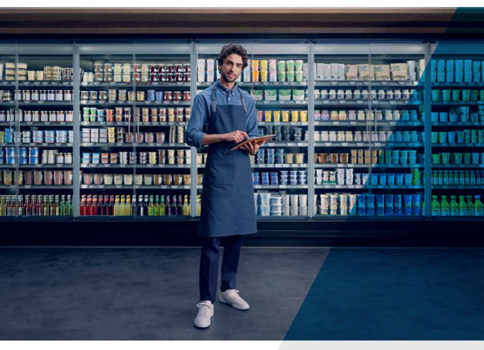
Emerson R290 Solutions